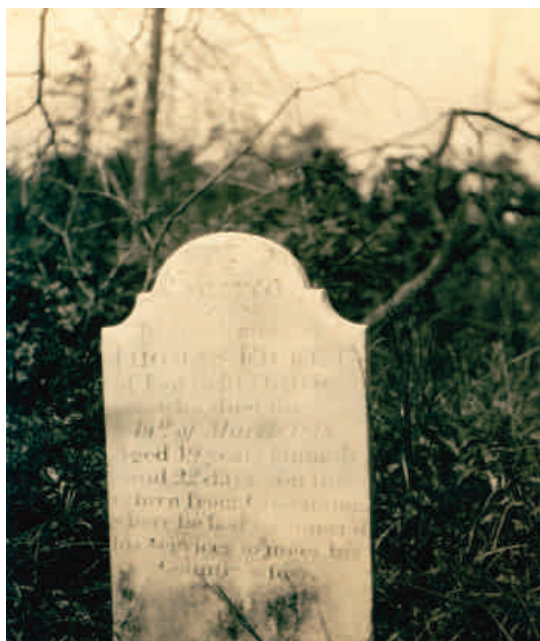
Some grave markers, like this one documented near the Old Congaree Road in Berkeley County, provide age at death in years, months, and days.