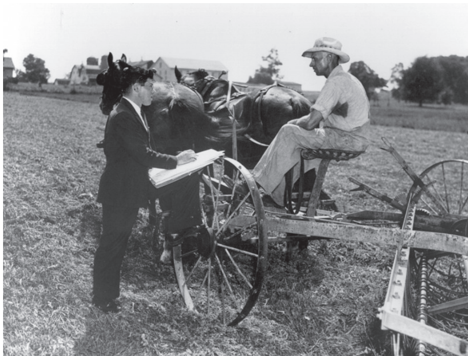
This intrepid census taker stops at nothing to interview a South Dakota farmer for the 1940 census.

Both population and special schedules provide fantastic clues about ancestral origins, economic status, and family dynamics. Clues. Yes, the information from a census schedule should be considered a clue for your family history journey. If you've looked at more than one census for the same members of your family, you've no doubt found conflicting information: women get younger, recollection of the immigration year